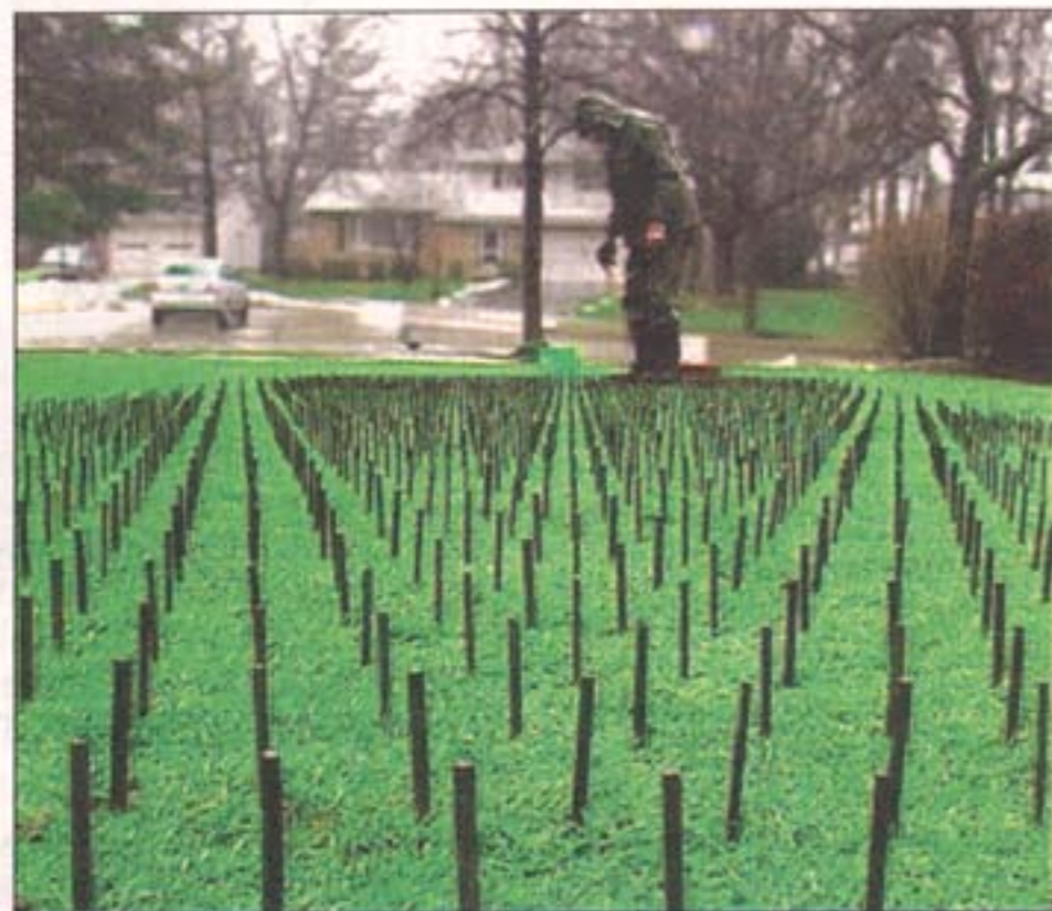
The Manolios (literally) weather the elements to prepare Eggshelland. Here Ron drives in the stakes for eggs during heavy rain. The display was hit by 16 inches of snow in 2008, an ice storm in 2002 and a hail storm in 1998.